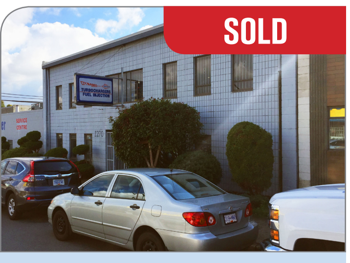
1270 FRANCES STREET, VANCOUVER SOLD PRICE: $3,850,000 • 12 ZONING • INCOME PROPERTY