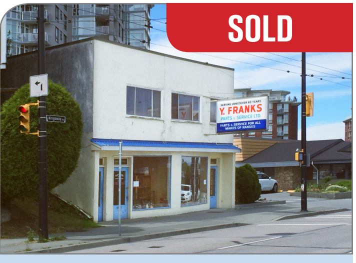
1490 KINGSWAY, VANCOUVER SOLD PRICE: $3,575,000 • C2 ZONING • INCOME PROPERTY