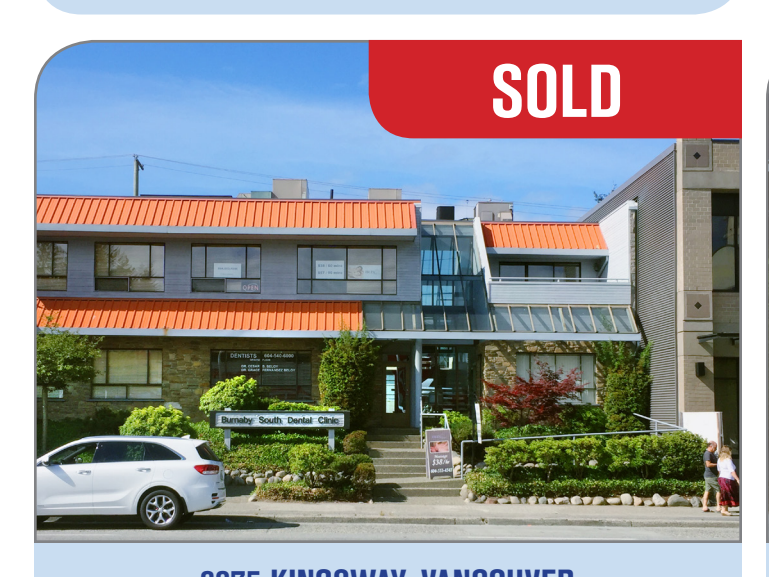
6975 KINGSWAY, VANCOUVER SOLD PRICE: $2,700,000 • C4 ZONING • INCOME PROPERTY