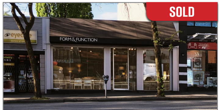
2035 WEST 41ST AVENUE, VANCOUVER • PRICE: $4,638,000 LOT AREA: 3,050 SF • BUILDING SIZE: 3,000 SF