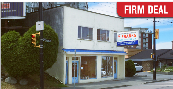
1490 KINGSWAY, VANCOUVER • PRICE: CALL AGENT LOT AREA: 3,800 SF • BUILDING SIZE: 5,948 SF

**Price per buildable SF is the sale price/land area X FSR