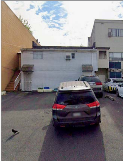
Parking in rear